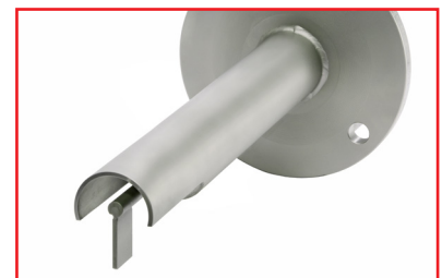
Robust, integrated protective cover