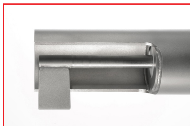
Paddle and shaft welded